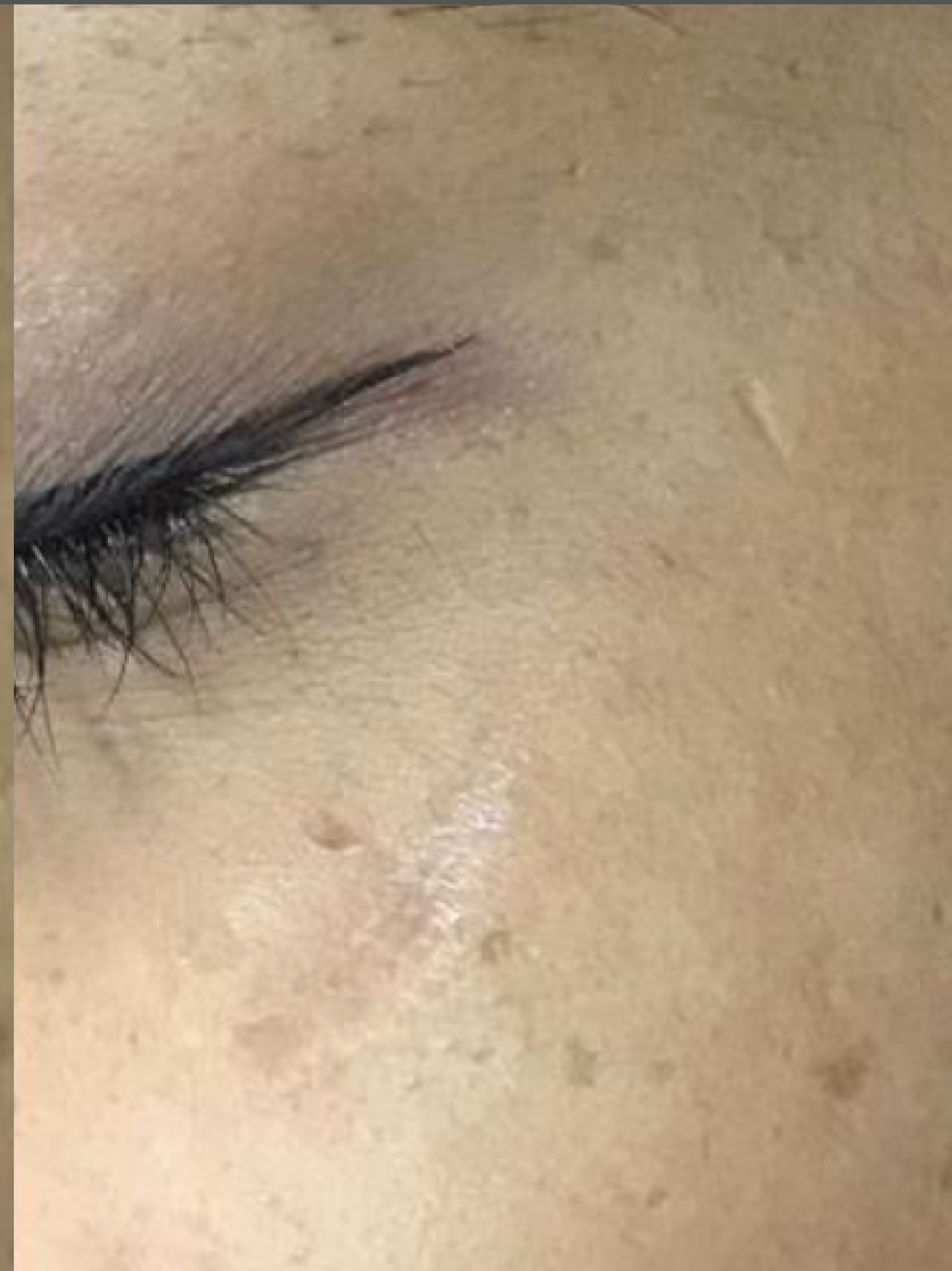
After 2 treatments