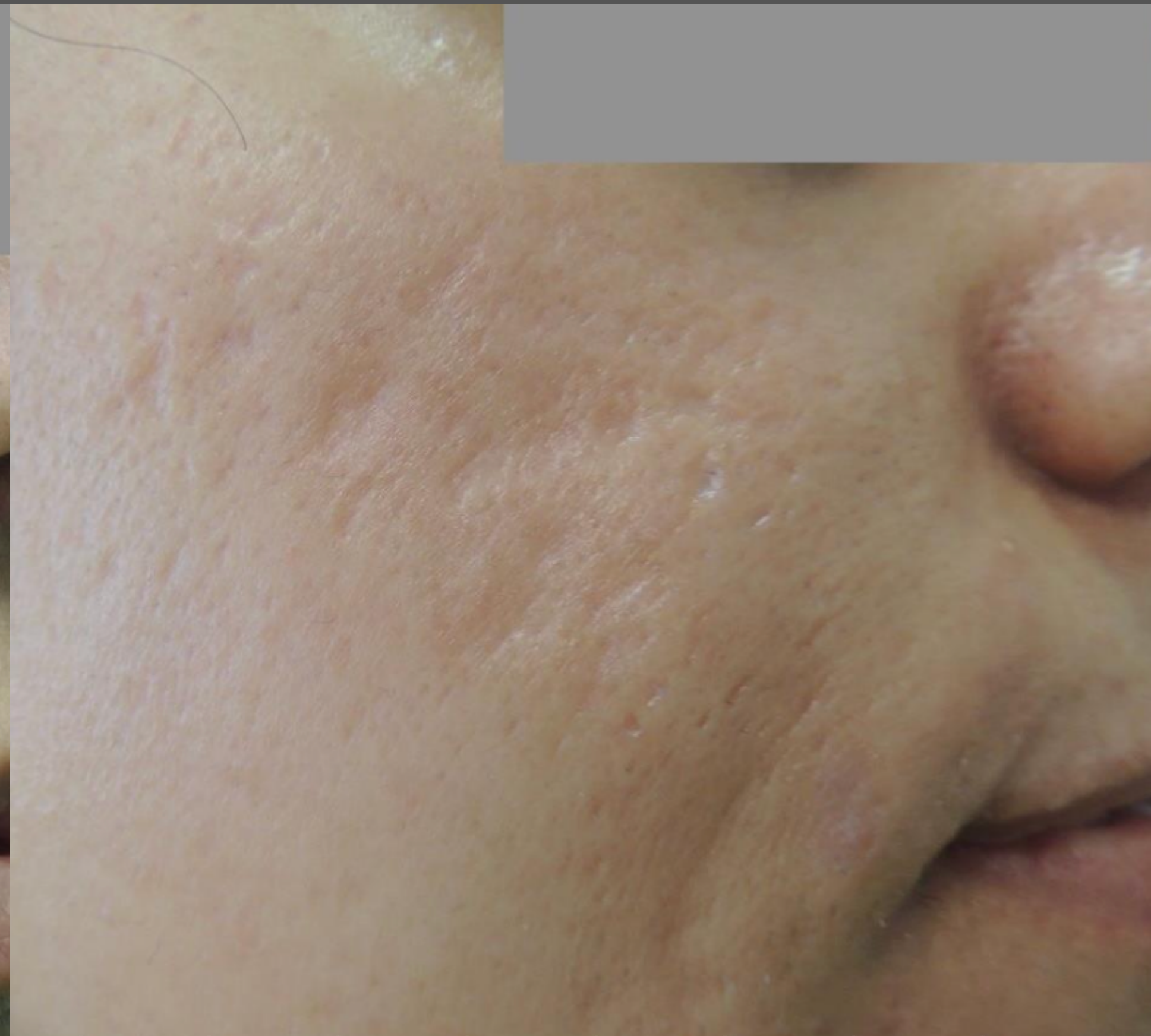
After 1 treatment