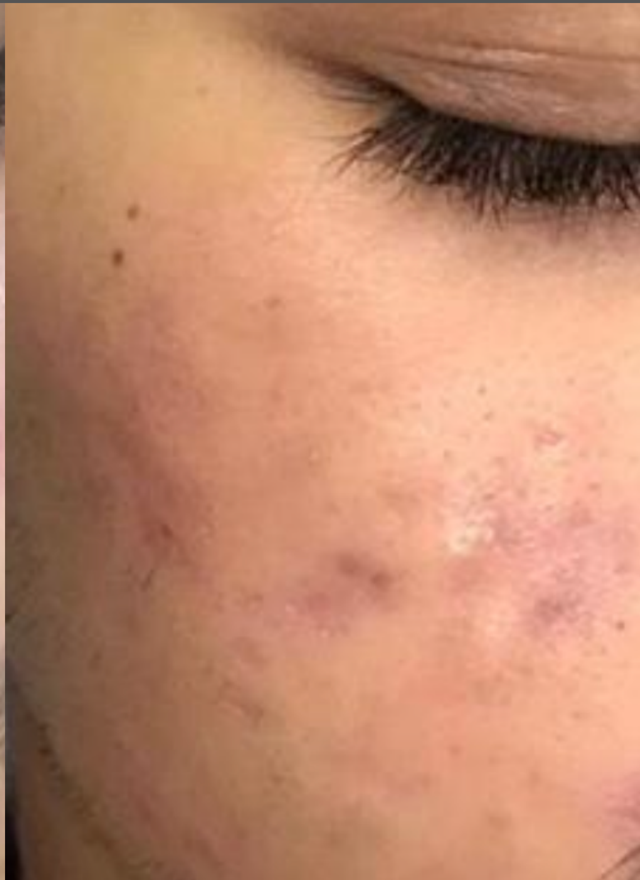
After 1 treatment