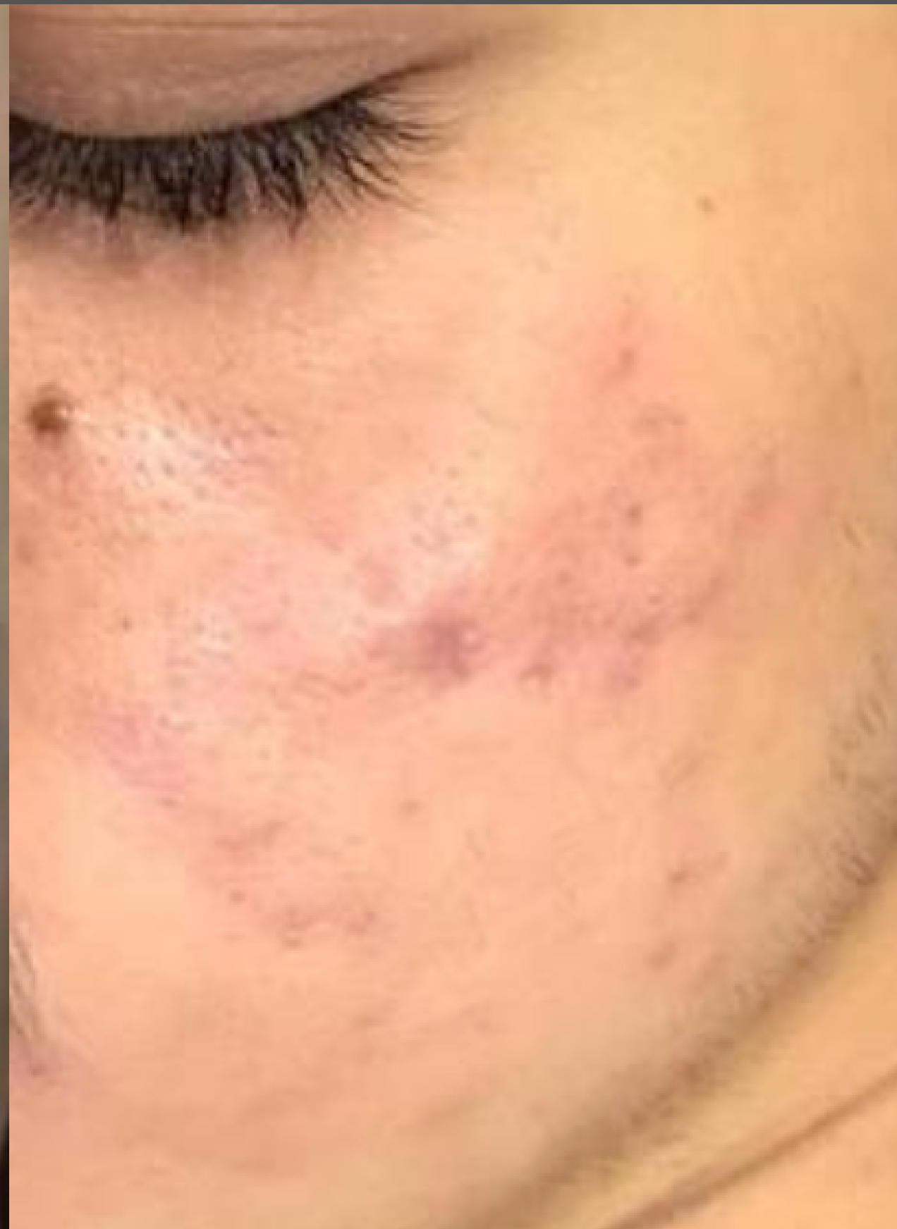
After 1 treatment