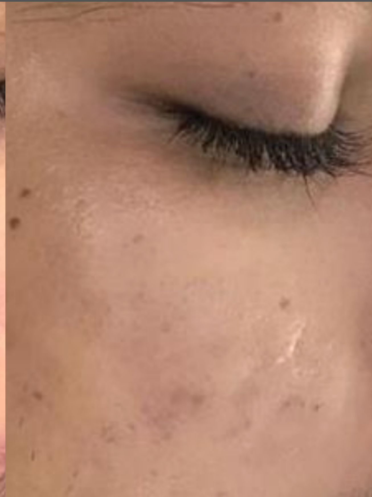
After 2 treatments