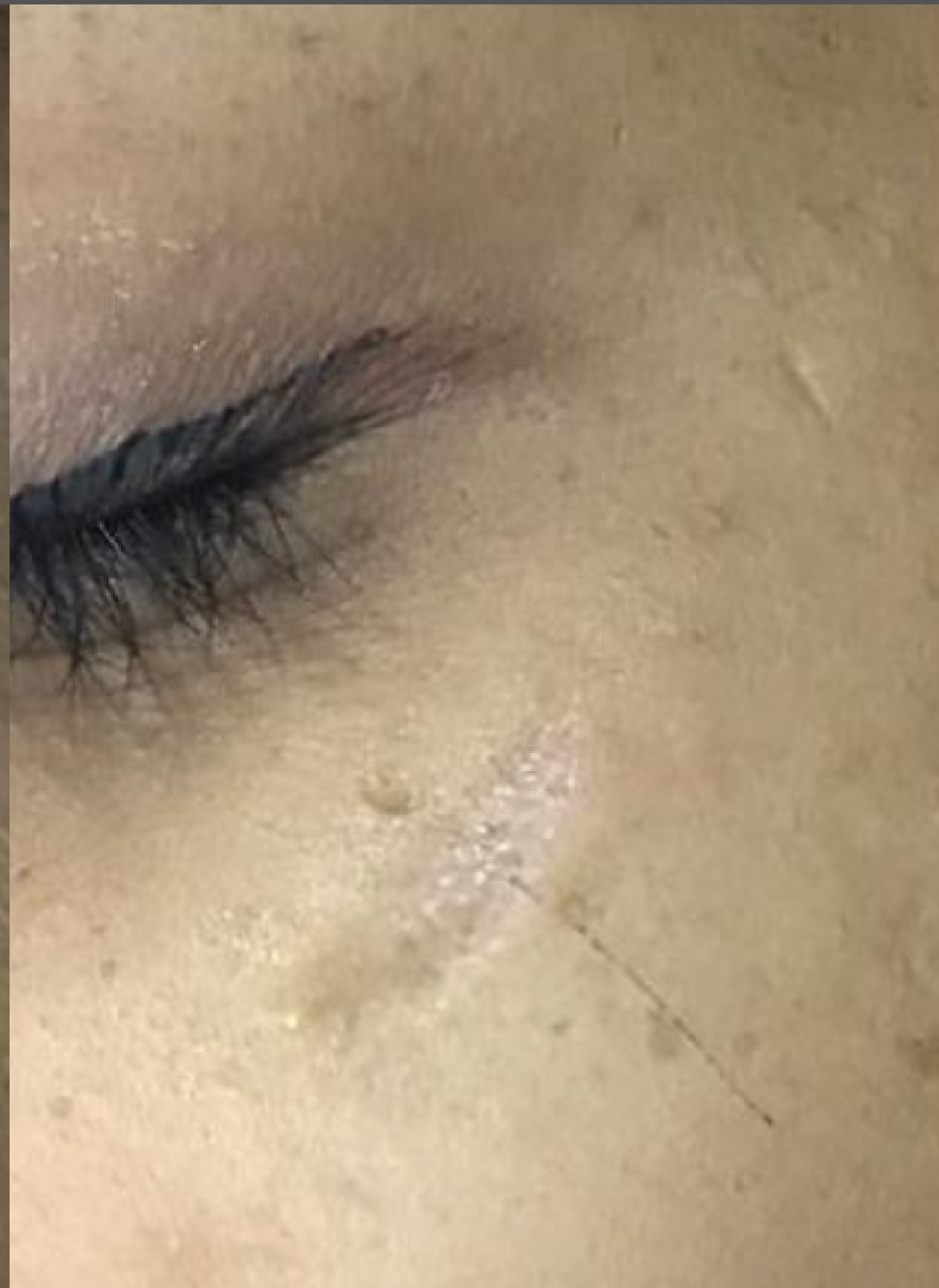
After 1 treatment