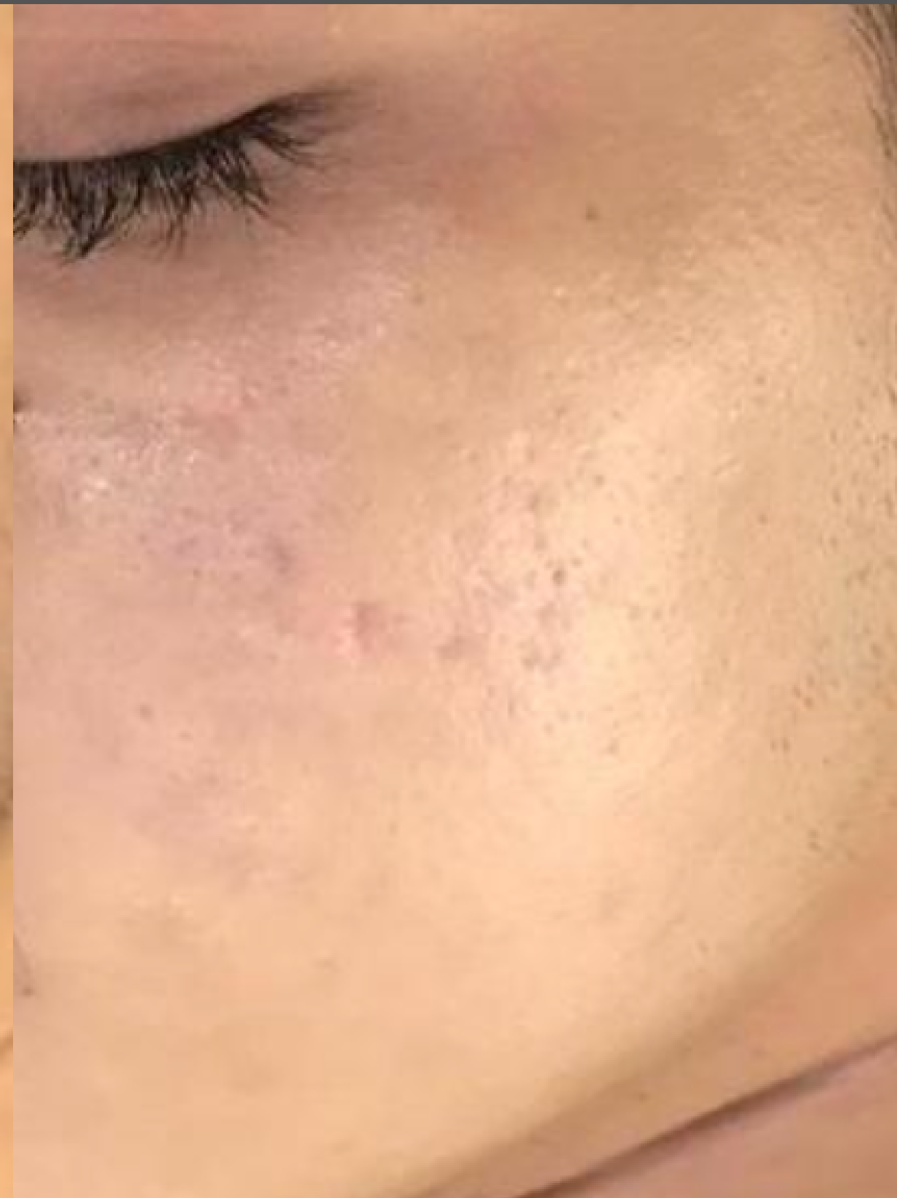
After 2 treatments